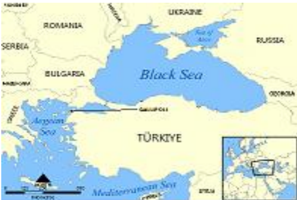
Map of Türkiye

Under Osman 1 and his successors, Turkish lands grew significantly, largely through seizure from the Byzantine Empire. This enabled the establishment of the Turkish Empire, which the Ottomans ruled as an Islamic Caliphate from 1299 until 1922.