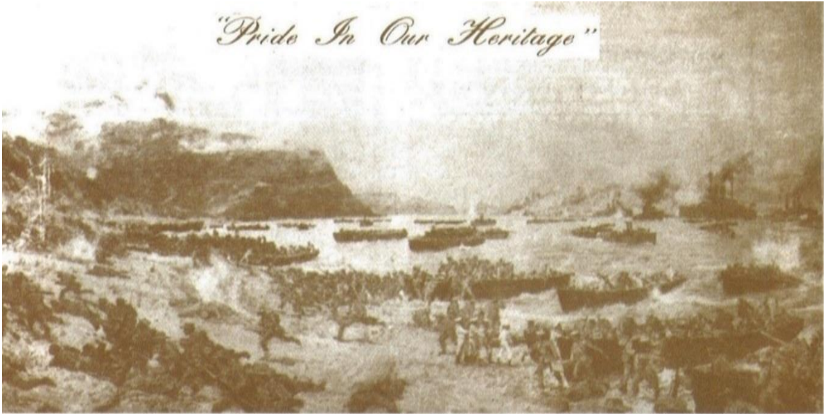
"The Landing" 25th April, 1915