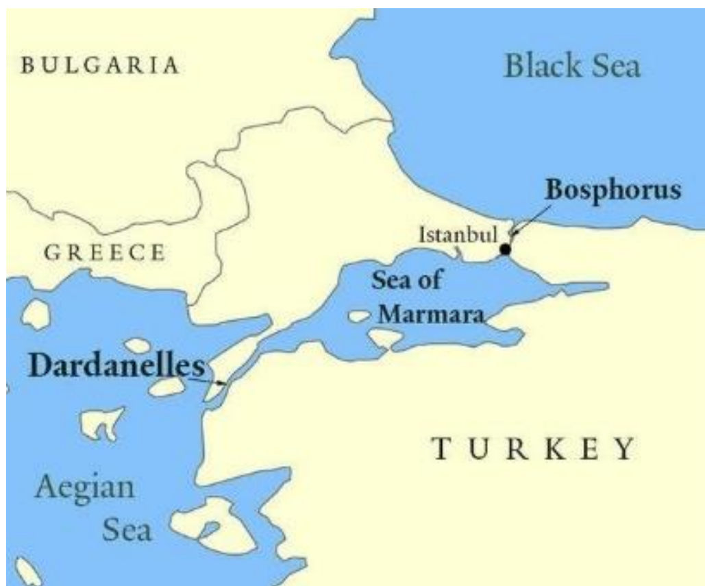
Marmara and Dardanelles Narrows.

Ostensibly, the primary objective of this attack was to relieve the Russians; however, the British had a particular motive to defeat Türkiye and seize its Middle East possessions. The Royal Navy, which was a vital component of British military might,