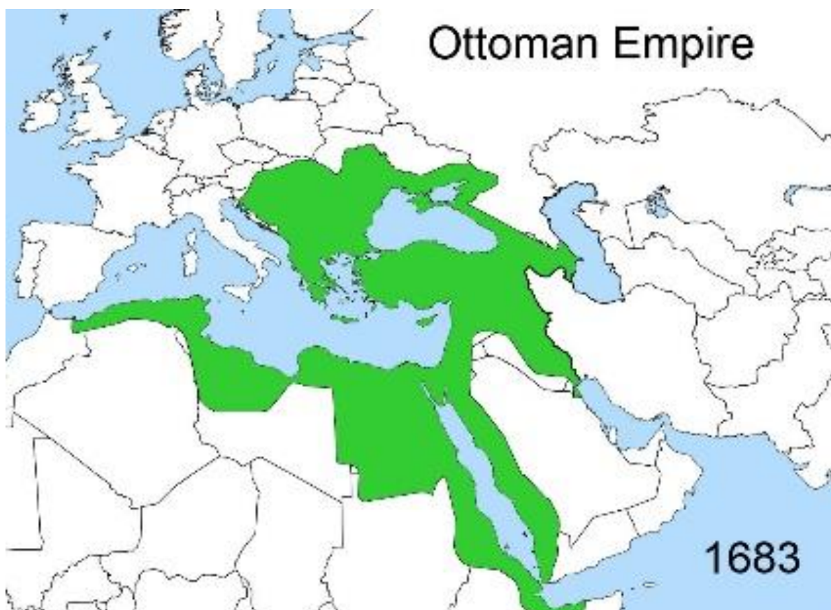
The Ottoman Empire 1683

From the late 16th century, Türkiye began to decline in power and territory due to military, economic, social, political and technological challenges. Militarily, having failed to capture Malta, it lost territory in wars against Austria, Poland, and Russia. It also faced rebellions in what is now Egypt, Syria, Iraq, and the Balkans. In the 17 th - 19 th centuries, it fought a series of wars with Russia, largely due to Russia's desire to establish a Black Sea warm water port. These led to Russia gradually acquiring what had previously been Turkish territory, beginning with Ukraine. These defeats were attributed to Türkiye's failure to adequately fund its armed forces.