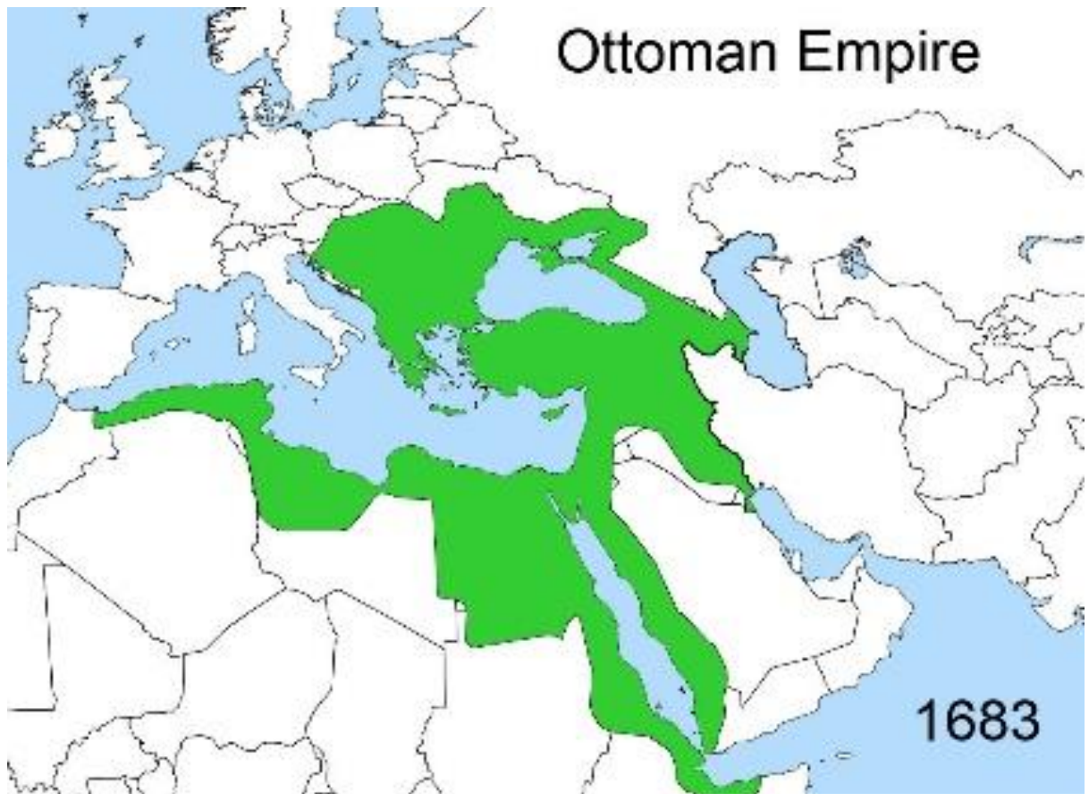
The Ottoman Empire 1683

From the late 16th century, Türkiye began to decline in power and territory due to military, economic, social, political and technological challenges. Militarily, having failed to capture Malta, it lost territory in wars against Austria, Poland, and Russia. It also faced rebellions in what is now Egypt, Syria, Iraq, and the Balkans. In the 17<sup>th</sup> - 19<sup>th</sup> centuries, it fought a series of wars with Russia, largely due to Russia's desire to establish a Black Sea warm water port. These led to Russia gradually acquiring what had previously been Turkish territory, beginning with Ukraine. These defeats were attributed to Türkiye's failure to adequately fund its armed forces.