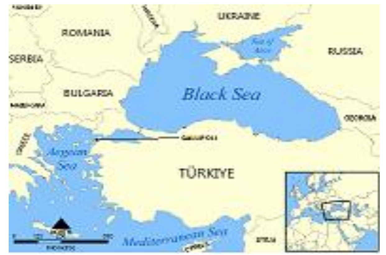
Türkiye's location has considerable strategic

Under Osman 1 and his successors, Turkish lands grew significantly, largely through seizure from the Byzantine Empire. This enabled the establishment of the Turkish Empire, which the Ottomans ruled as an Islamic Caliphate from 1299 until 1922.