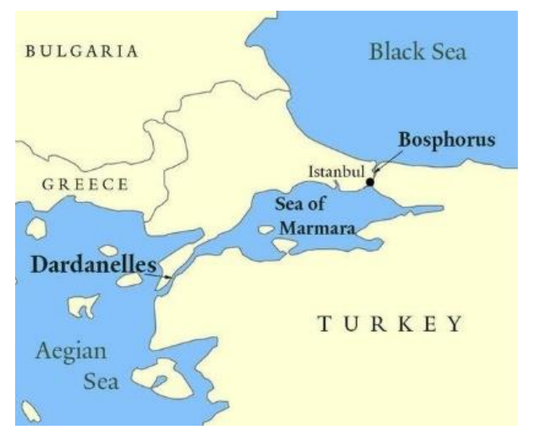
Marmara and Dardanelles Narrows.

Ostensibly, the primary objective of this attack was to relieve the Russians; however, the British had a particular motive to defeat Türkiye and seize its Middle East possessions. The Royal Navy, which was a vital component of British military might,